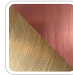
NAT Natural Brass/ Copper